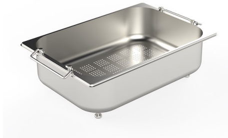
Stainless steel colander 8154 000